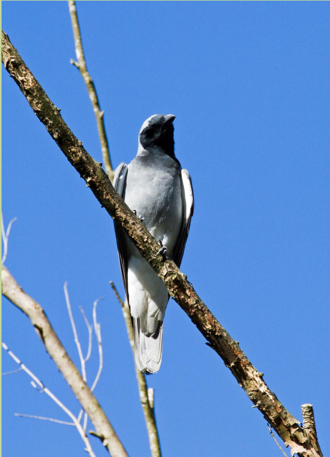
Black Faced Cuckoo Shrike