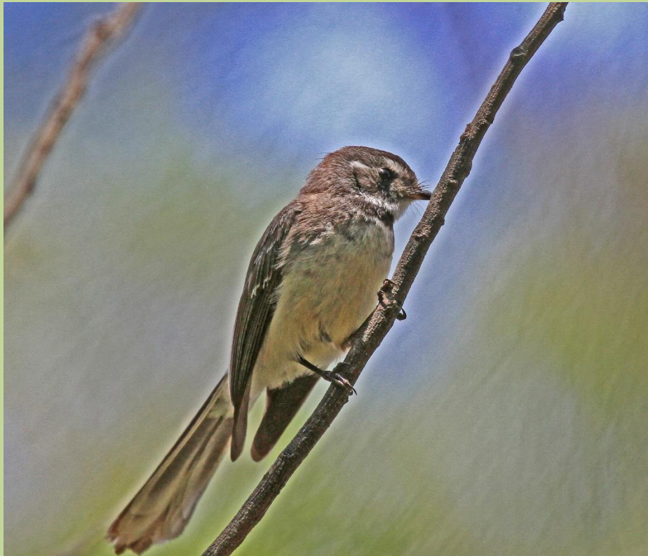
Grey Fantail, above, and Rainbow Lorikeets, below