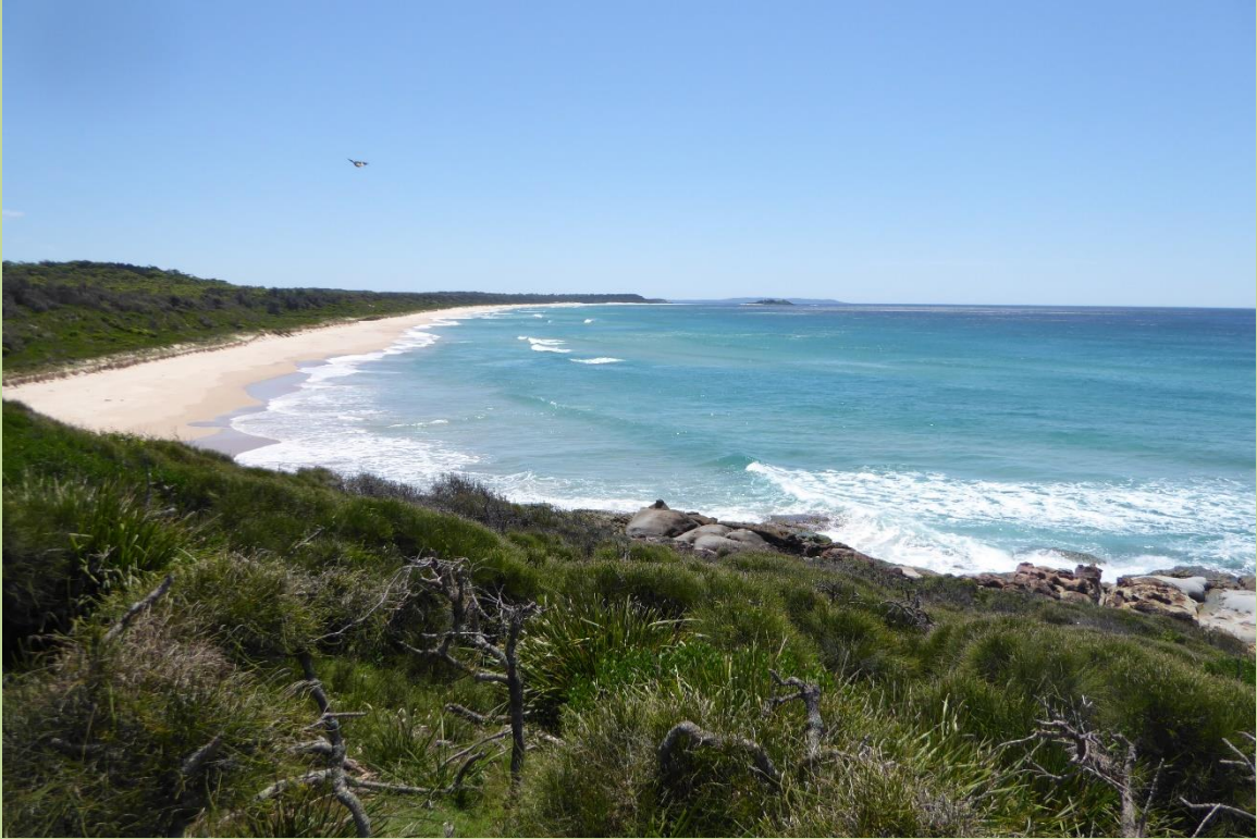
From Buckley's Point