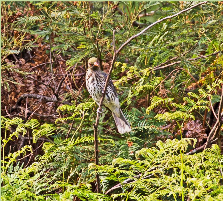
Olive Backed Oriole