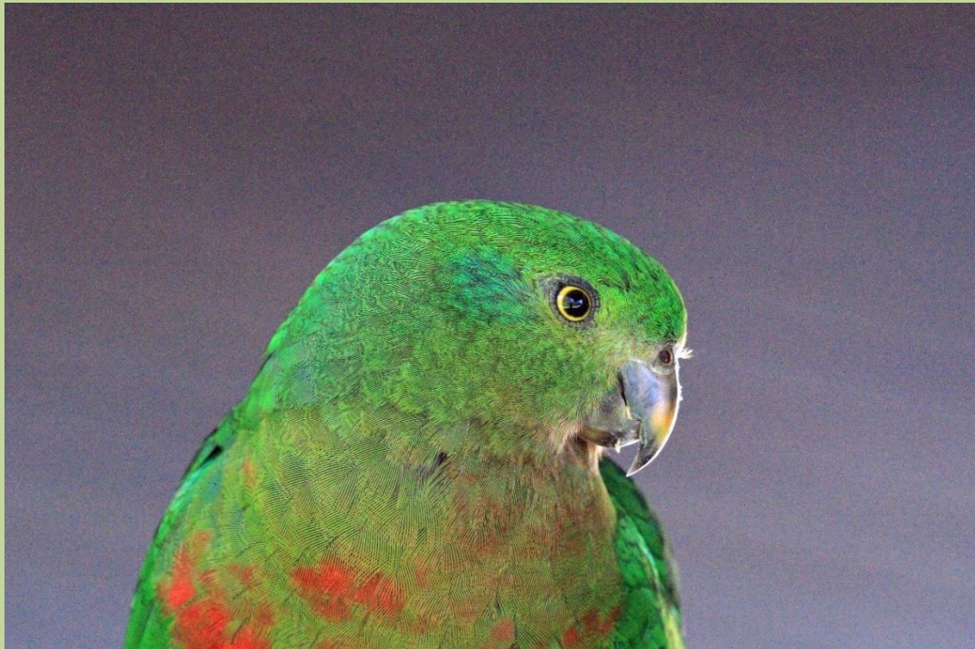
Young male King Parrot